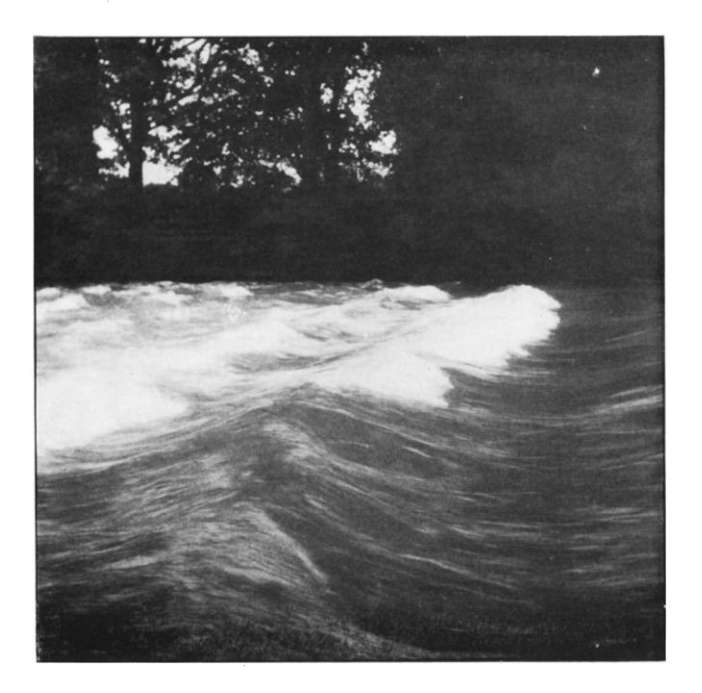
FIG. 3.—STATIONARY WAVES ON THE RIVER AARE.