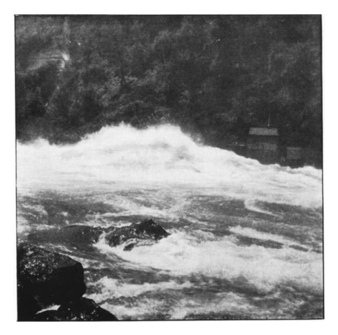
FIG. 4.-LEAPING WAVE, WHIRLPOOL RAPIDS, NIAGARA.