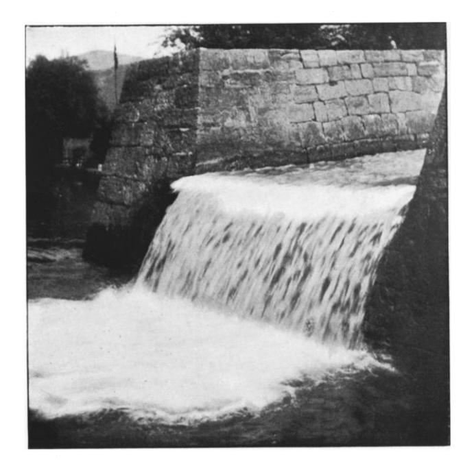
FIG. 2 .- ROLL-WAVE LEAPING THE OUTFALL OF THE GRÜNNBACH CONDUIT.